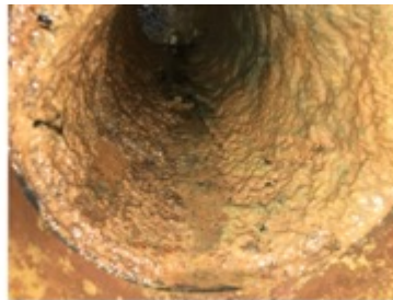
Start of ProMoss™ treatment