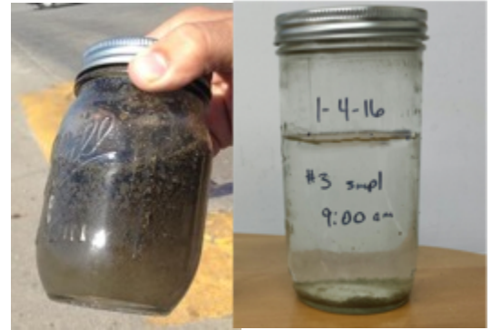
Oil contaminatated cooling water