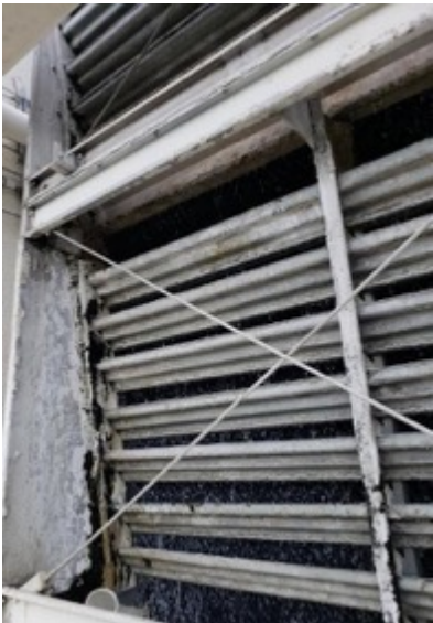
After 1 month of ProMoss™