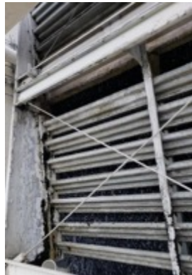
After 1 month of ProMoss™