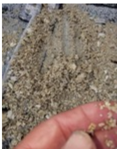
After 2 weeks

Added ProMoss™ 3 to system. Went back 2 weeks later and vacuumed out tower basin. Went back after another 2 weeks, vacuumed out basin once again and changed out ProMoss™ 3.