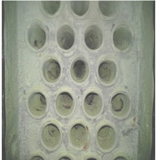
After one year of ProMoss™