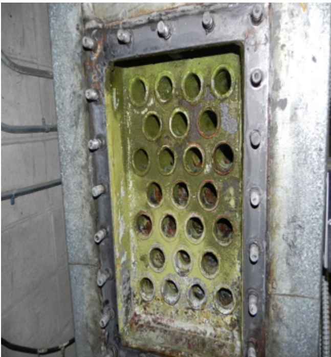
After three years on ProMoss™