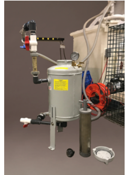
Our FA-1000 test rig. Suction strainer and optional filter shown

If you have any other thoughts or suggestions regarding contact chambers for The Moss™, please let us know