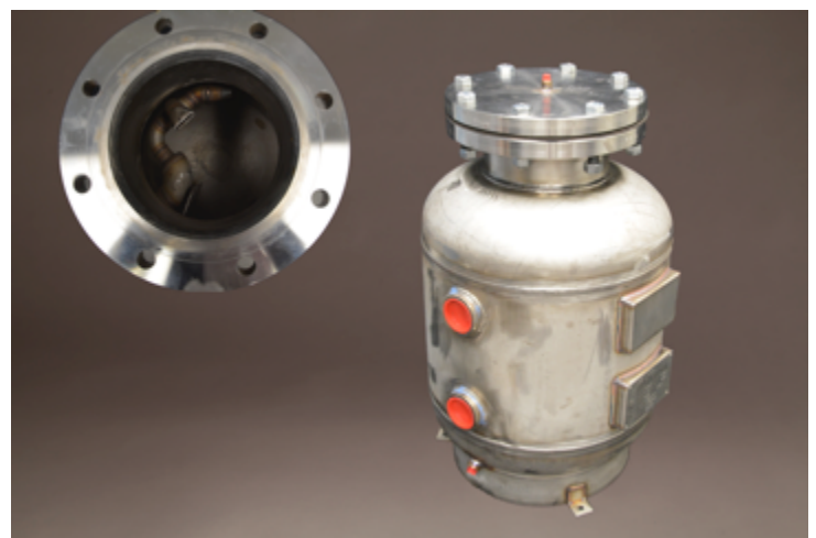
Weighing in at about 180 lbs., this vessel has internals shaped just like the fiberglass/PVC version of the CC-80/CC-180.