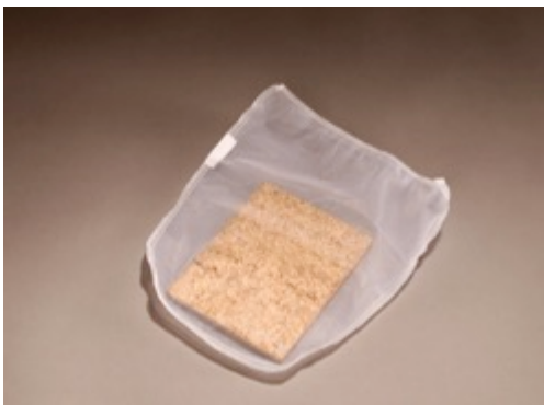
← PoolMoss ® Pro 1 Starter

PoolMoss ® Pro for ponds and fountains brings the power of Sphagnum moss to the residential ponds and fountains. In addition to providing a new level of enjoyment for home users, it also reduces the time, cost, and effort associated with maintenance and service issues. Sized according to a pond's water volume, the dosage of PoolMoss ® Pro for ponds and fountains is easily determined and applied. The system starts with the easily installed CC-F or CC-STxS and PoolMoss ® Pro, which is easily changed on a monthly basis.