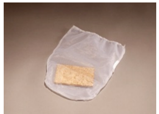
PoolMoss ® Pro .5 Maintenance →