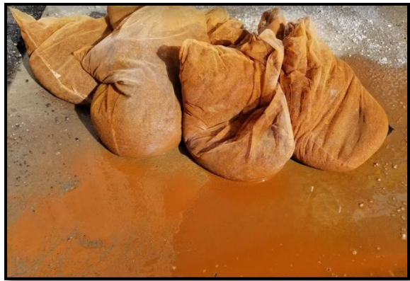
Used bags of ProMoss show the iron that has been absorbed from the loop water.