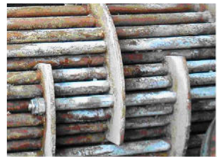
Figure 2 Scale accumulation on a heat exchanger from a pool without Sphagnum moss.