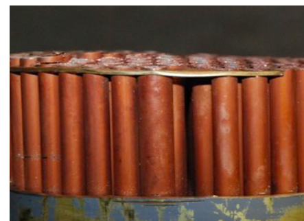
Figure 3 Heat exchanger from a pool on Sphagnum moss for 4 years.

The accumulation of scale and corrosion, as shown in Figure 2 above, causes two main problems.